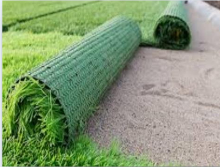
Artificial Grass Sand