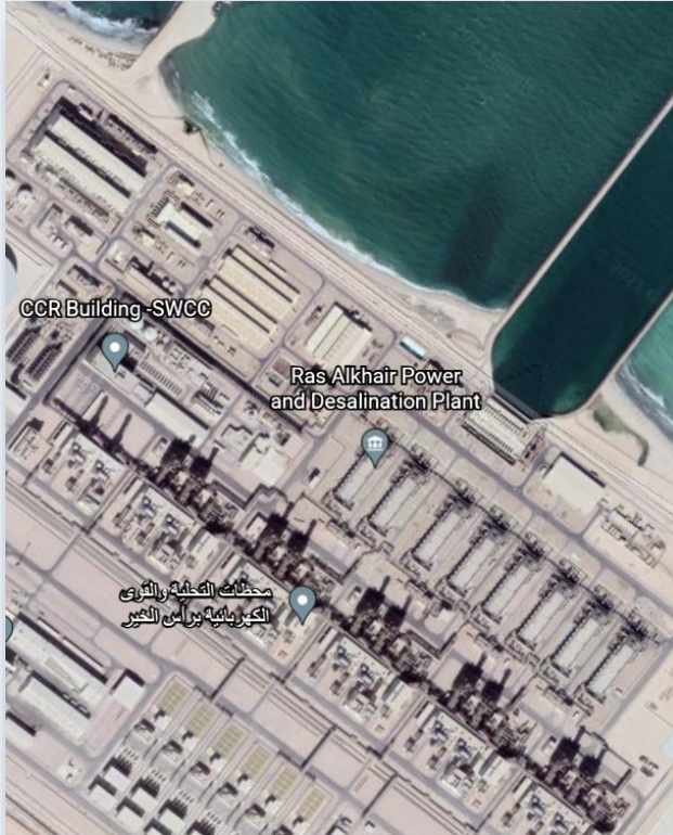
RAS ALKHAIR DESALINATION PLANT