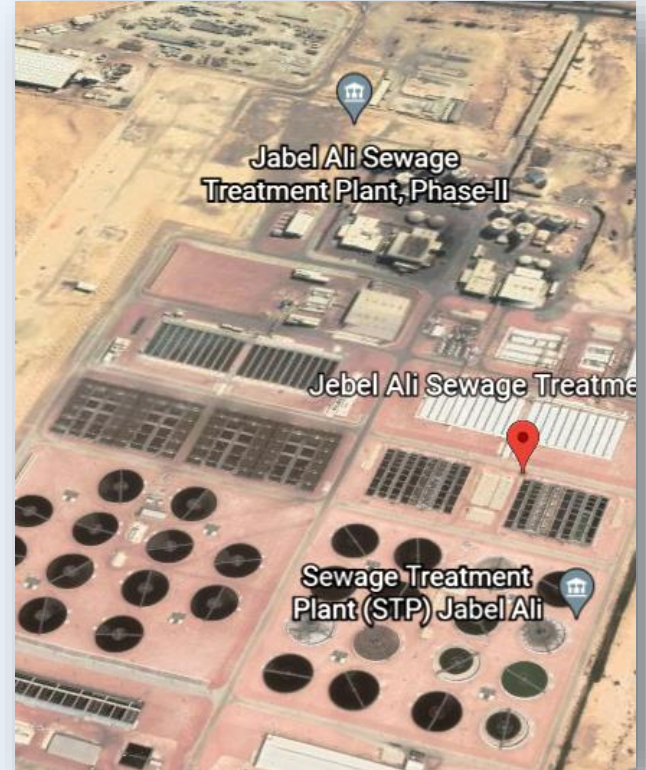
JEBEL ALI SEWAGE TREATMENT PLANT