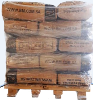
50 KG Paper Bags