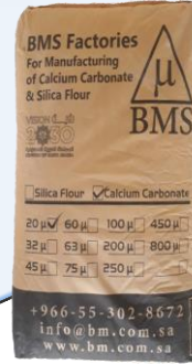
25/50 KG Paper Bags