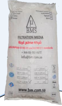
50 Kg pp Bag