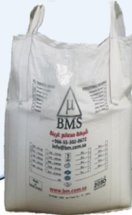
1.6 Ton Jumbo Bags